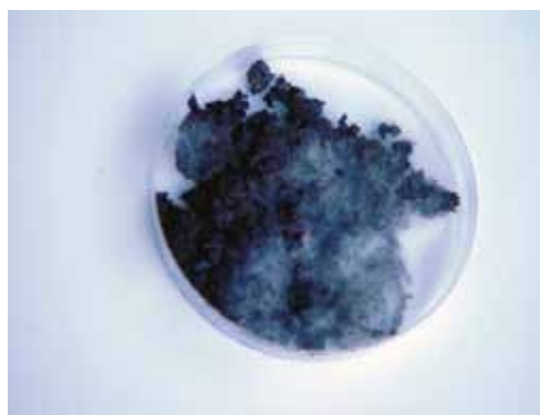
BIOflex PVC vinyl that has been in a landfill for 30 days